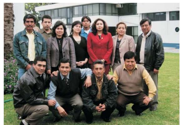
Workshop participants during laboratory visit

ERT presented the early findings of the surveys to PLNG, the Peruvian authorities and other stakeholders at a workshop in April, and is presently preparing a fully interpretative report based on the data from the first year of monitoring.