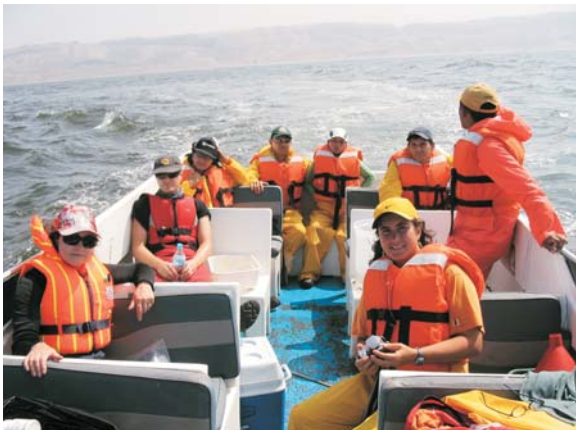
High speed transit to survey area in summer survey

The work is focused in shallow waters up to 16 m deep in the gently shelving coastal zone. As no marine infrastructure is yet in place at the site, subtidal sampling activities are being conducted from small boats mobilised each day from Tambo de Mora and Paracas up to 100 km to the south.