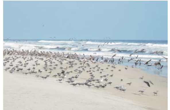
Abundant bird life on Melchorita beach

The objective of the work is to monitor the impacts on the marine environment and fisheries from the construction of the new marine export terminal being built at Pampa Melchorita, approximately 125 km south of Lima. Here long stretches of sandy beach, exposed to the Pacific swell and backed by 140 m cliffs, are fished by artisan fishermen from the local communities of Chincha and Cañete.